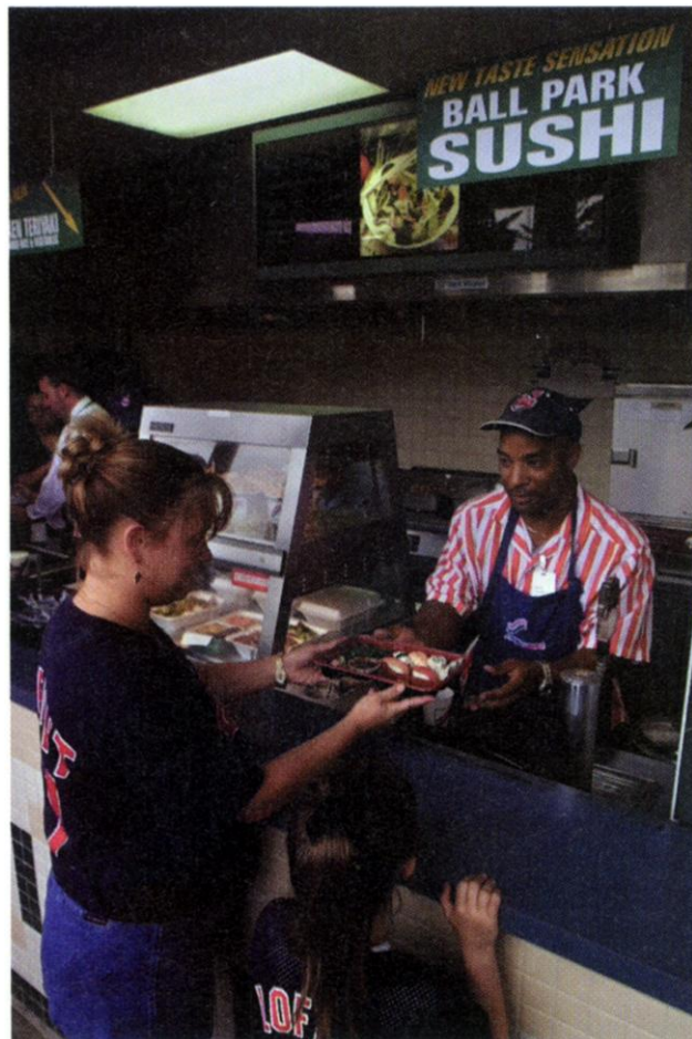
A dash of civilizations

Japan’s emergence on the global economic scene in the 1970s as the business destination du jour, coupled with a rejection of hearty, red-meat American fare in favor of healthy cuisine like rice, fish, and vegetables, and the appeal of the high-concept aesthetics of Japanese design all prepared the world for a sushi fad. And so, from an exotic, almost unpalatable ethnic specialty, then to haute cuisine of the most rarefied