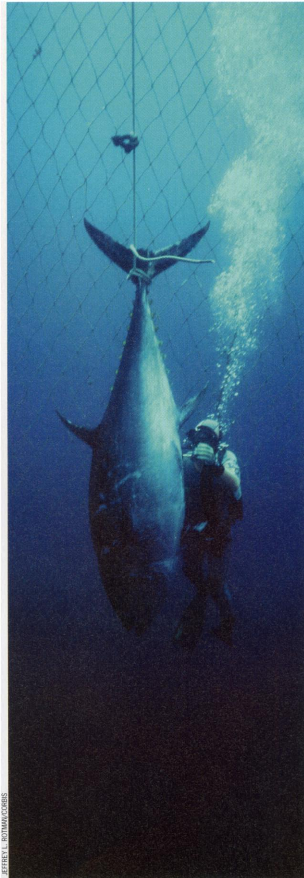
Liquid assets: A diver ropes a bluefin tuna caught in a net.

On the docks, too, Japanese cultural control of sushi remains unquestioned. Japanese buyers and "tuna techs" sent from Tsukiji to work seasonally on the docks of New England laboriously instruct foreign fishers on the proper techniques for catching, handling, and packing tuna for export. A bluefin tuna must approximate the appropriate kata , or "ideal form," of color, texture, fat content, body shape, and so forth, all prescribed by Japanese specifications. Processing requires proper attention as well. Special paper is sent from Japan for wrapping the fish before burying them