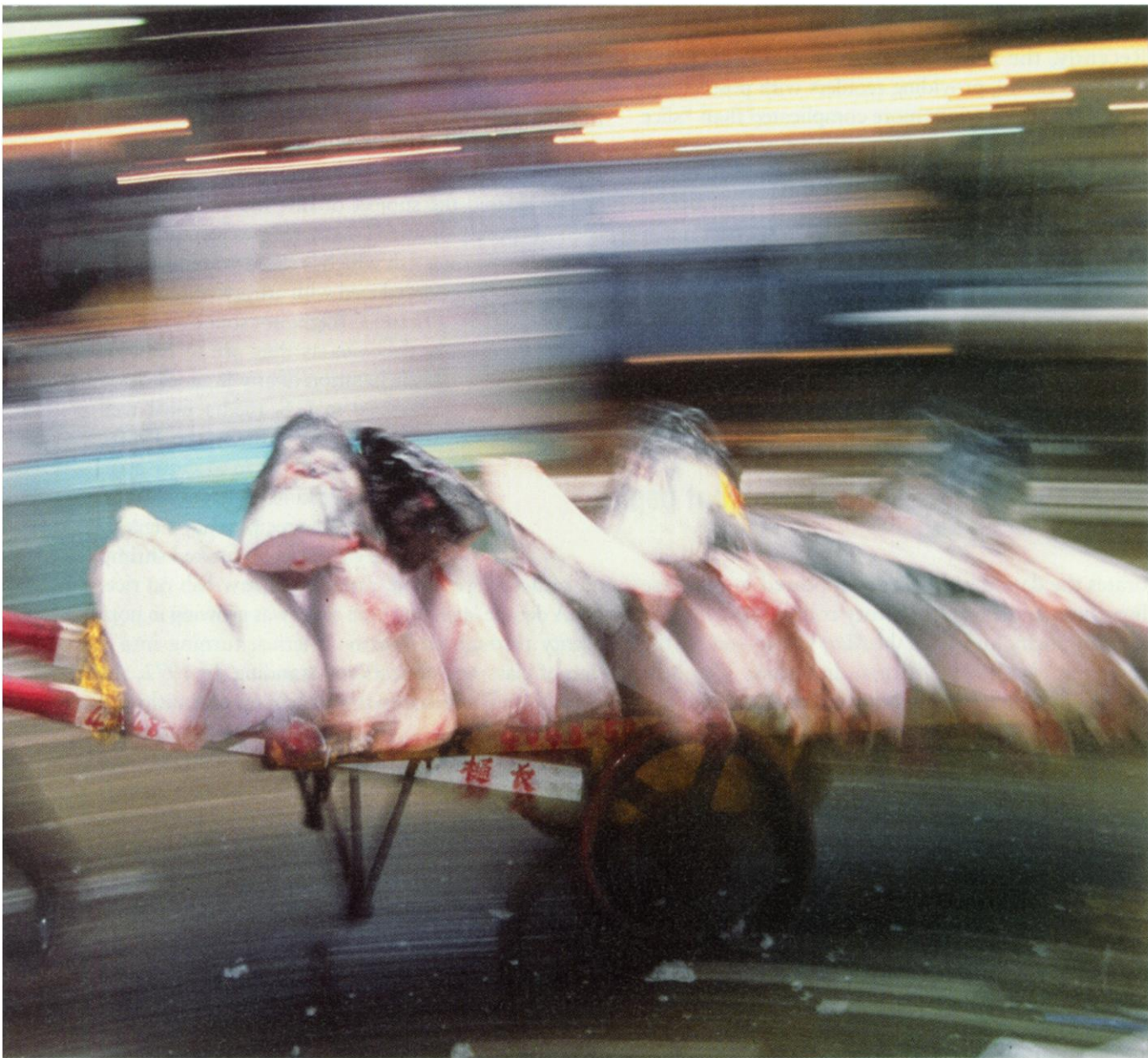
market, where 60,000 traders will move more than 2.4 million kilograms of seafood in one 12-hour shift.

loaded onto the backs of trucks in crates of crushed ice, known in the trade as “tuna coffins.” As rapidly as they arrived, the flotilla of buyers sails out of the parking lot—three bound for New York’s John F. Kennedy Airport, where their tuna will be airfreighted to Tokyo for sale the day after next.