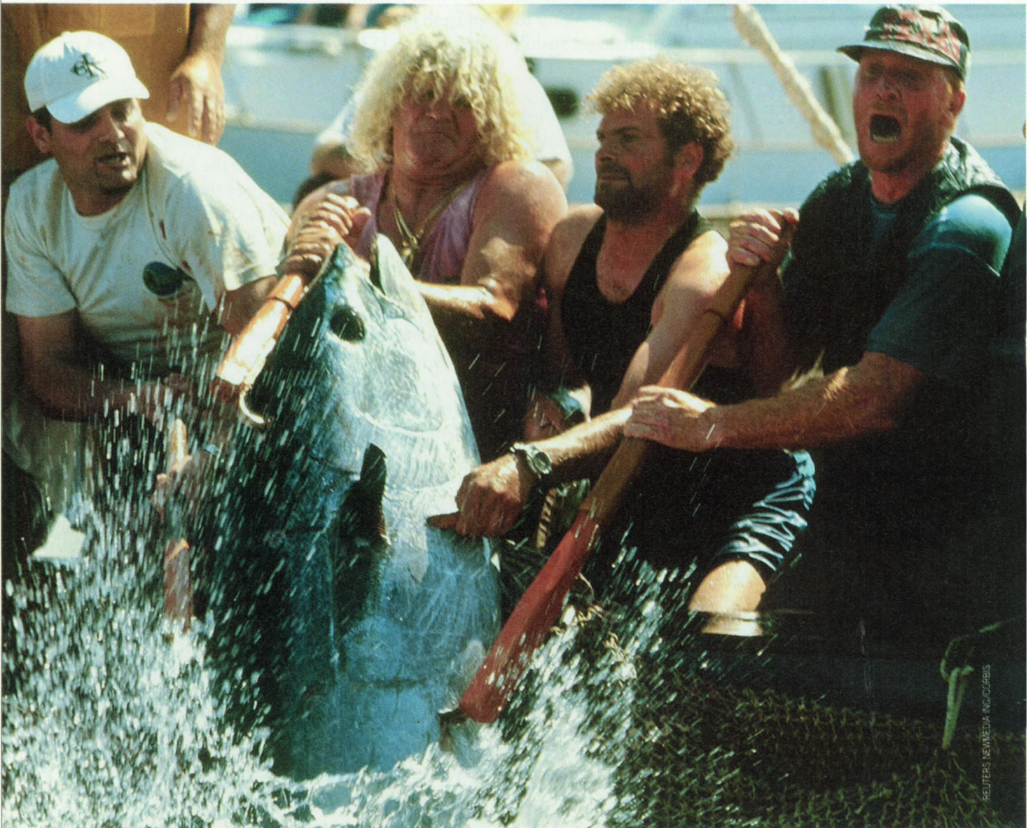
Free-range sushi. Fishermen off the coast of Favignana, Sicily, haul a tuna from their nets. Many such outfits are backed by Japanese capital.

Atlantic bluefin tuna ("ABT" in the trade) are a highly migratory species that ranges from the equator to Newfoundland, from Turkey to the Gulf of Mexico. Bluefin can be huge fish; the record is 1,496 pounds. In more normal ranges, 600-pound tuna, 10 feet in length, are not extraordinary, and 250- to 300-pound bluefin, six feet long, are commercial mainstays.