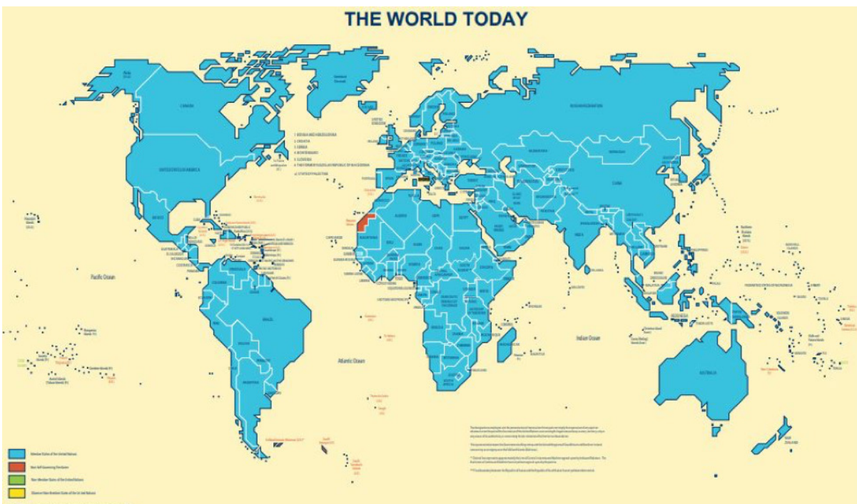
Maps from the United Nations.