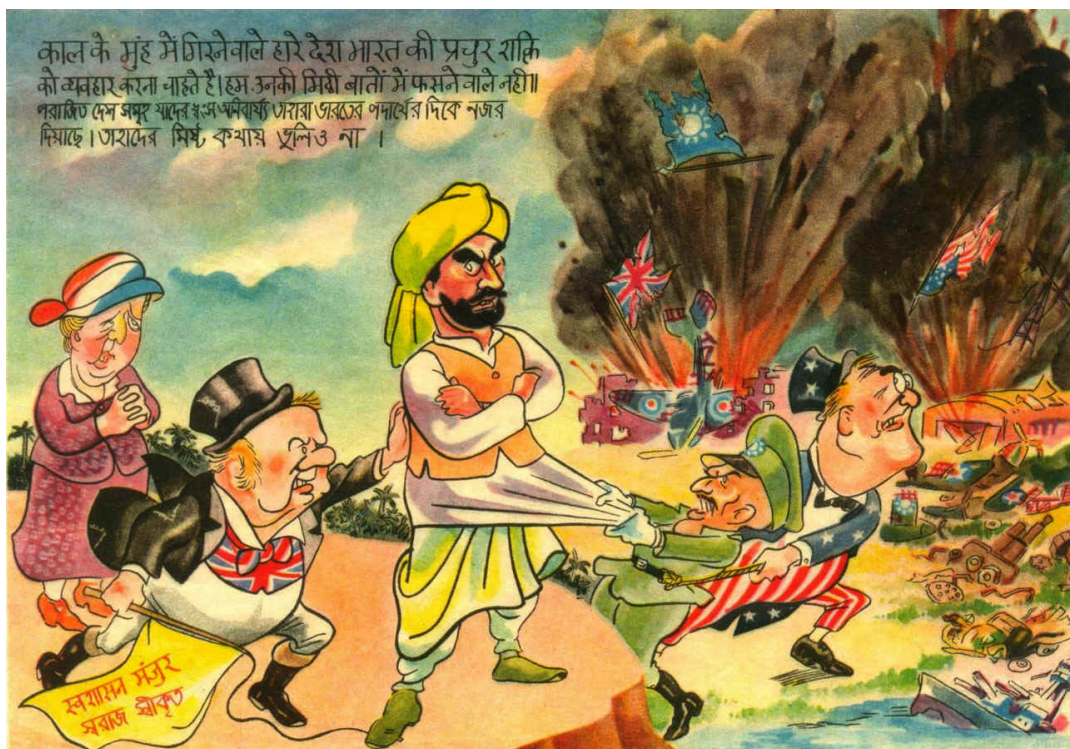
A Japanese leaflet urging Indian subjects of the British Empire to rise up against Britain during the Second World War. Public domain.

One of the global theories about why decolonization happened when it happened links to the Second World War. In a few cases, the events of the war directly led to decolonization. In Asia, the Japanese tried hard to stir up sentiment against their European enemies. In some cases, Japanese invasions of European colonies helped launch anti-colonial movements against European empires in Asia.