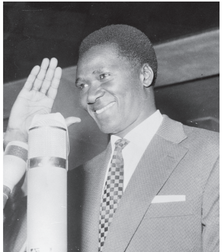
Ahmed Sékou Touré, leader of the independence movement in Guinea, West Africa. He created a political party that managed to unify much of the population of Guinea, despite it having many ethnic groups and different religions. This nationalist movement was successful in ending French rule in Guinea in 1958.

Nationalism was the main instrument of those who sought to gain sovereignty and independence for their nations. It's hardly surprising, since nationalism is rooted in people's desire for a homeland. But we've seen how it can also be twisted into an excuse for one group of people declaring the right to govern or oppress others. With decolonization, however, nationalism was about self-rule, meaning the oppressors had to go. The leadership of the new nationalist political parties that emerged in the colonies in this period were often veterans (remember those soldiers in colonies who fought for the empires that controlled them?). And there were others who were dissatisfied with colonial rule and stepped up to lead. But all of these leaders had to win the support of the people and unite those who had been divided by colonialism. For that reason, the period from the 1940s through the 1960s was very much a story of nationalist leaders trying to convince the people of the colony to unite, work together, and overthrow colonial rule for good. Once they did that, they were usually successful!